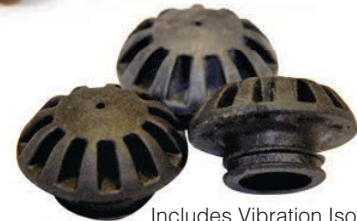
Includes Vibration Isolators