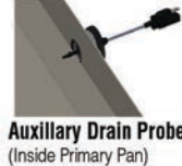
Auxiliary Drain Probe (Inside Primary Pan)